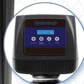
Also available with 785 valve