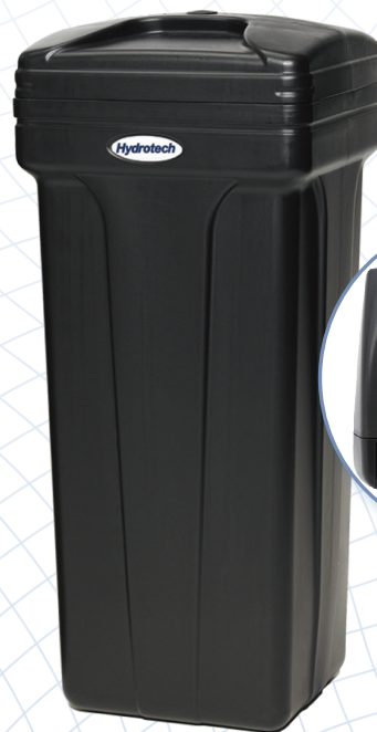
Brine Tank Included