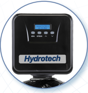
565 valve Simple user friendly 2